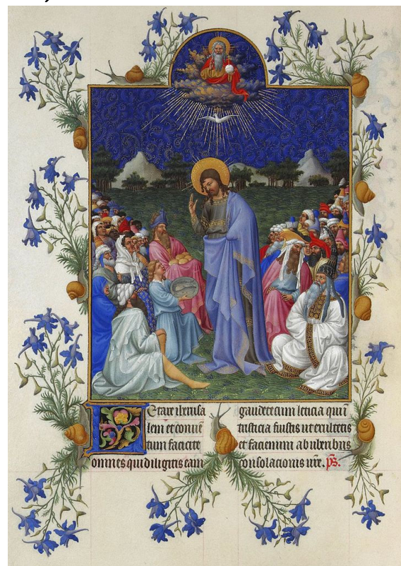
The Feeding of the Multitude. (1411-1416). The Brothers Limbourg (1794-1872). Tempera on vellum.