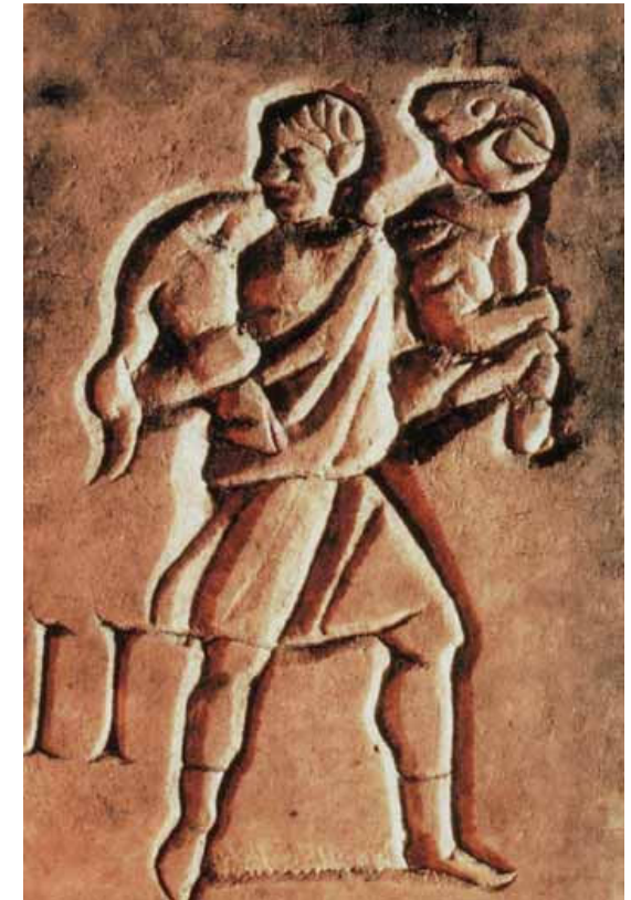
The Good Shepherd , carved on an inscription dedicated in memory of 7-year-old Apuleia Chrysopolis, Catacomb of St Callisto, Rome, 4 th century