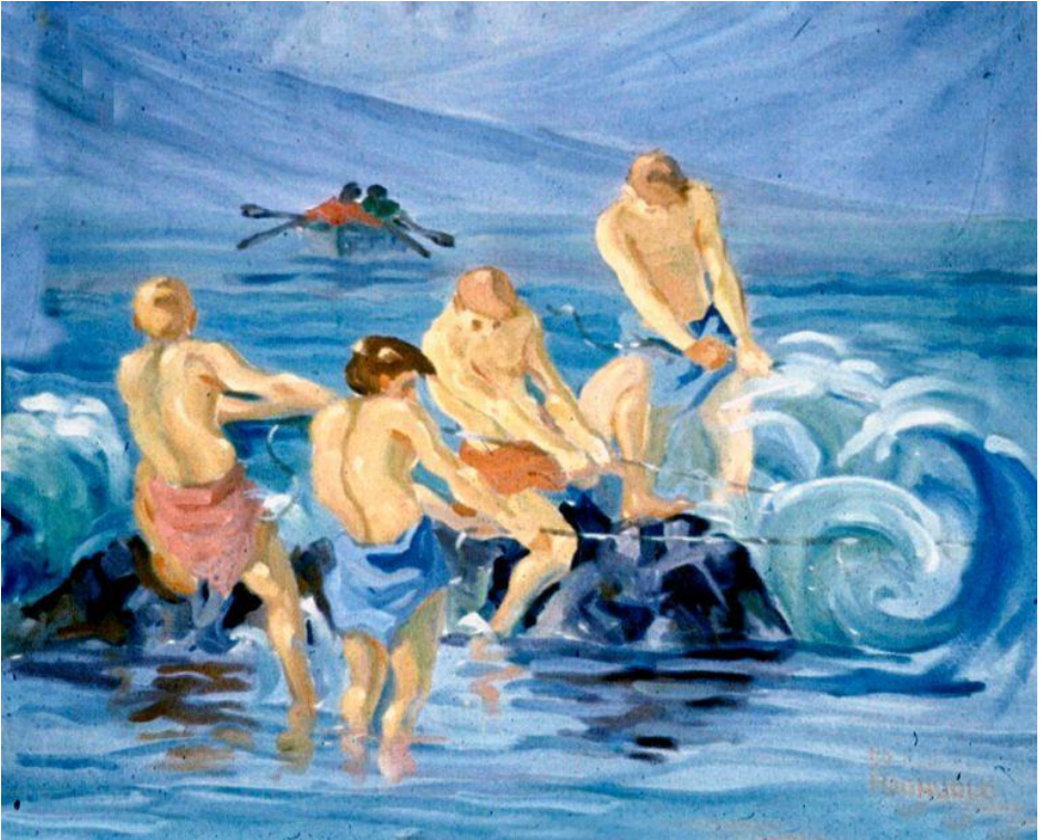
Fishers of Men. (ign.). Peter Bagnolo (ign. – present). Oil and watercolour on canvas.