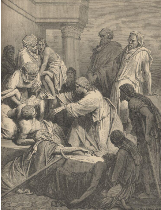
Untitled (Jesus healing the sick) . (c. 1866). Gustave Doré (1832-1883). Woodcut.