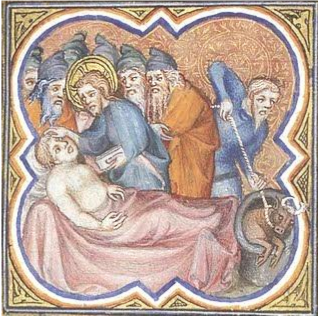
Jesus heals a man with dropsy, mosaic, artist unknown