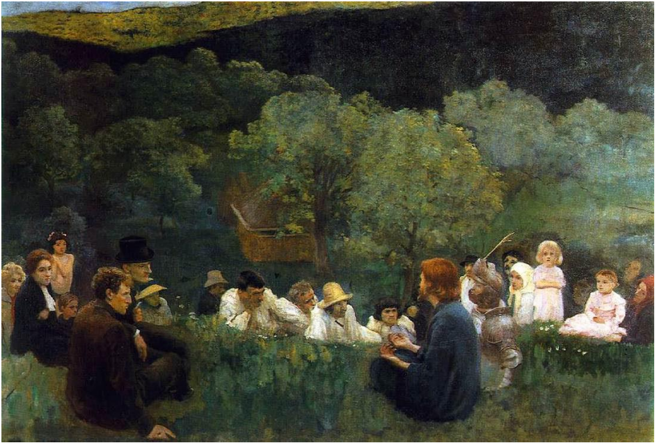
Sermon on the Mount. (1896). Karoly Ferenczy (1862-1917). Oil on canvas