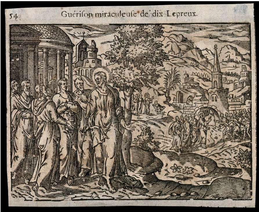
Guérison miraculeuse de dix Lepreux. (ign.). Anonymous. Woodcut.