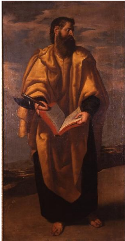
San Bernabé . (c. 1660). Antonio Arias Fernández (1614-1684). Oil on canvas.