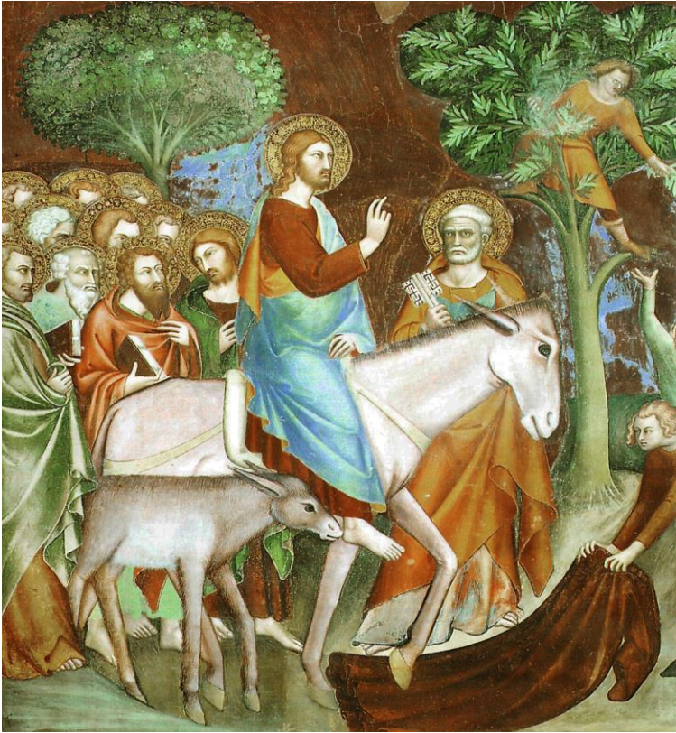
Jesus enters Jerusalem on a Donkey, Lippo Memmi, 14th century