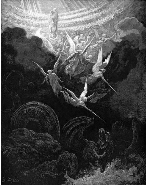
The Crowned Virgin: A Vision of John, Revelation 12:1-3. (1866). Gustave Doré (1832-1883). Illustration.