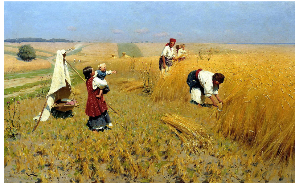
Harvest in Ukraine. (19c.). Mykola Pymonenko (1862 – 1912). Oil on canvas.