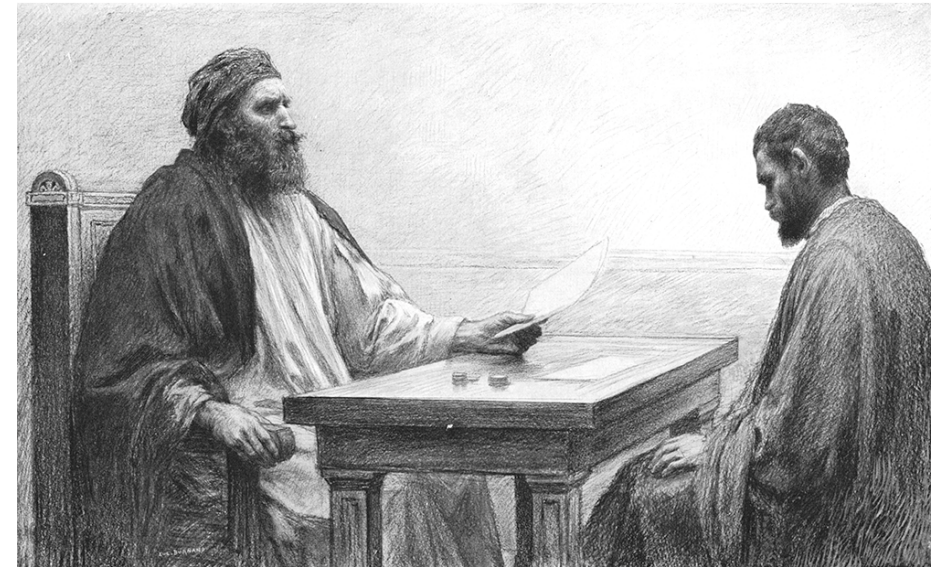
Parable of the Unjust Steward. (1905-1908). Eugène Burnard (1850 – 1921). Illustration.

The Ninth Sunday after Trinity August 13, 2017