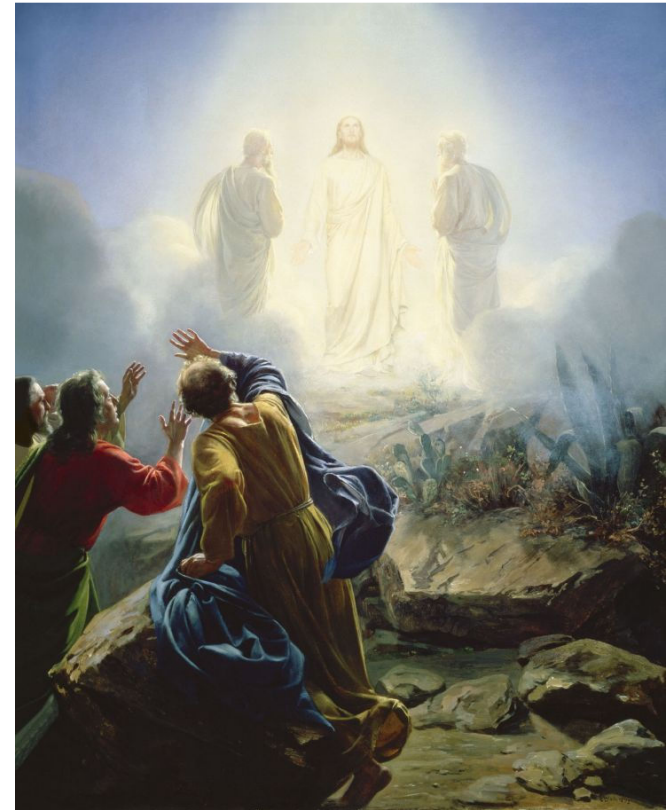
Transfiguration. (1865 - 1879). Carl Heinrich Bloch (1834 - 1890). Oil on canvas.