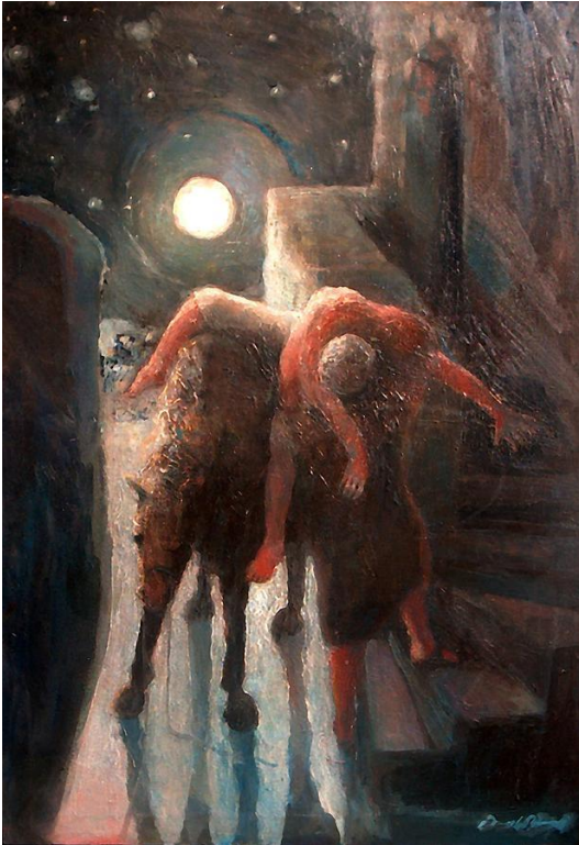
The Moon and the Good Samaritan. (c. 2012). Daneil Bonnell (b. 1955). Oil on canvas.