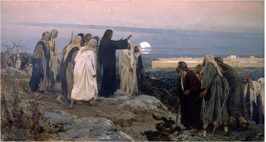
Flevit super illam [He wept over it]. (1892). Enrique Simonet (1866-1929). Oil on canvas.