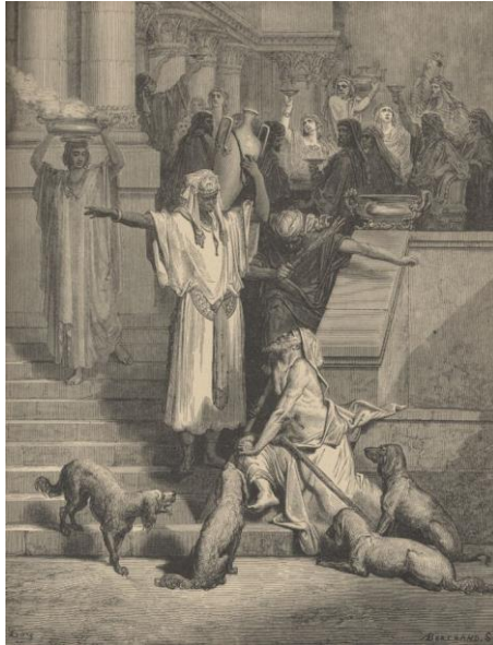
The parable of the rich man and Lazarus. (pub. 1891). Gustave Doré (1832-1883). Illustration.