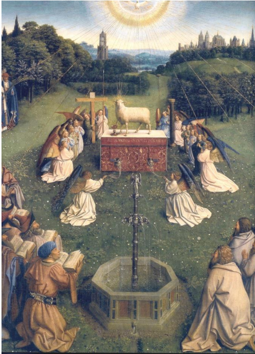
Adoration of the Mystic Lamb (detail from the Ghent Altarpiece). (1432). Jan van Eyck (1390-1441). Oil on wood.