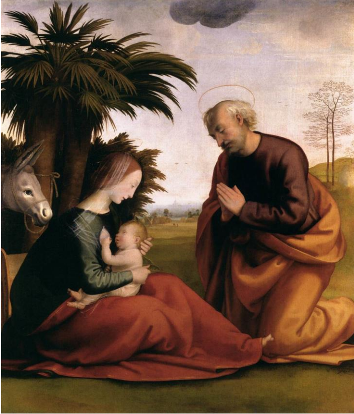
Rest on the flight to Egypt. (c. 1500). Fra Bartolomeo (1472-1517). Tempera and oil on canvas.