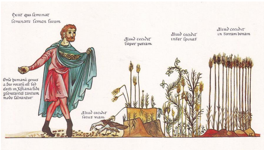
Hortus Deliciarum, Das Gleichnis vom Sämman. c. 1180. Herrad von Landsberg (Ign.). Illustration.