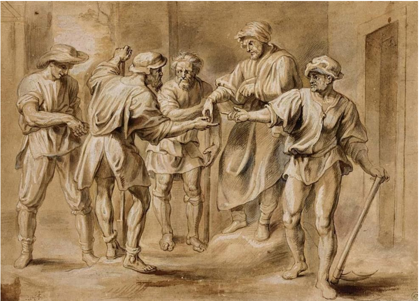
The Parable of the Workers in the Vineyard, Erasmus Quellinus II, 17 th century