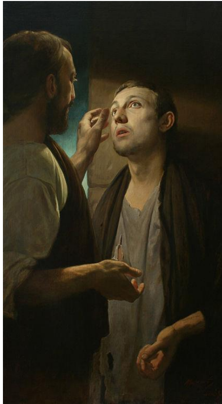
Christ and the pauper. Healing of the blind man (2009). A. N. Mironov (b. 1975). Oil on canvas.