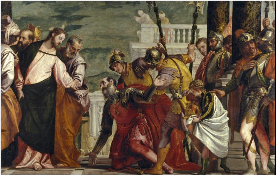
Jesus and the Centurion. (c. 1571). Paolo Veronese (1528-1588). Oil on canvas