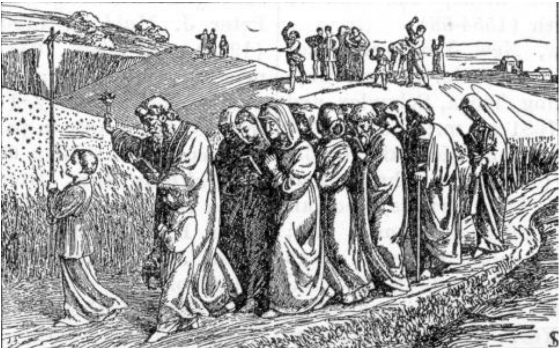
Rogation Sunday Procession