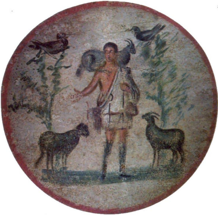
Jesus, the Good Shepherd. (3 rd Century). Catacomb of Priscilla (a Christian tomb beneath Rome).