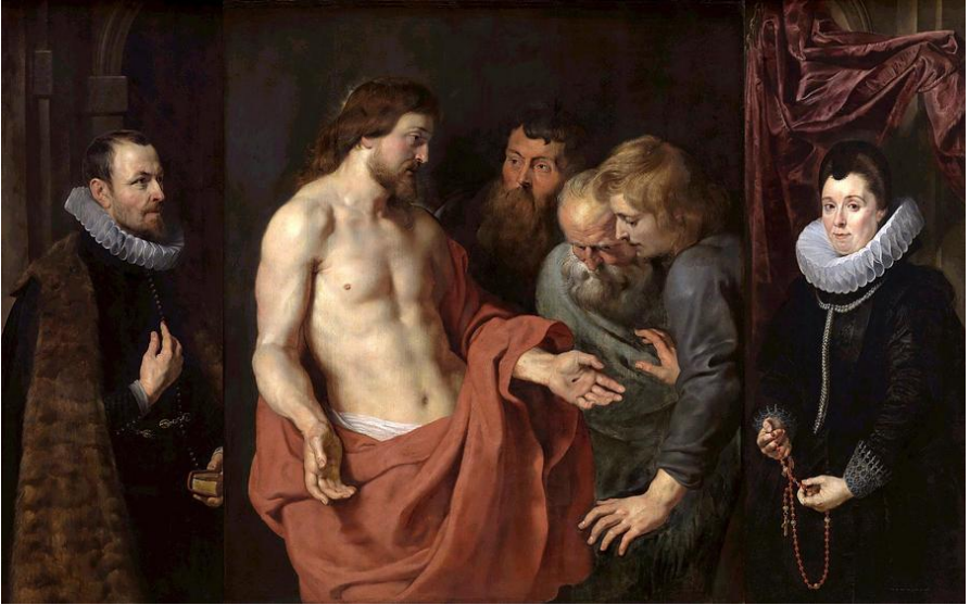
The Incredulity of St Thomas, Peter Paul Rubens, c 1611