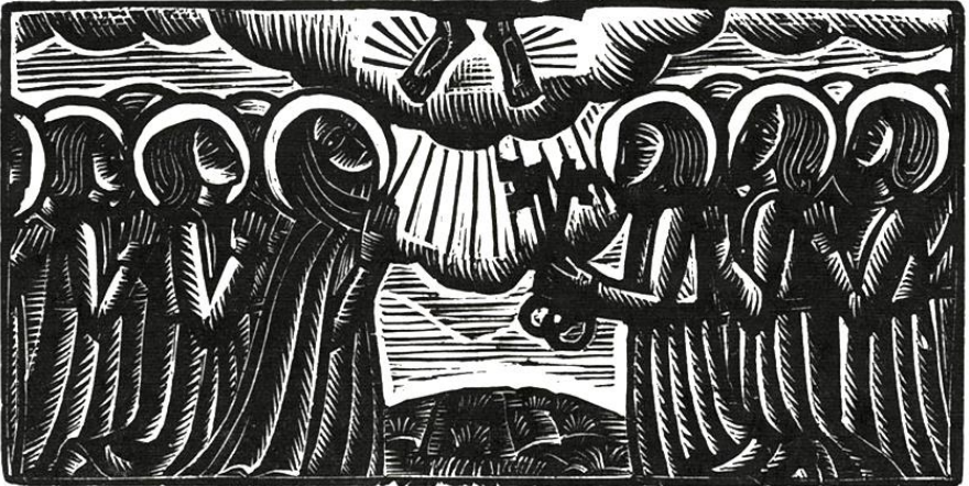
Ascension, David Jones, 1925