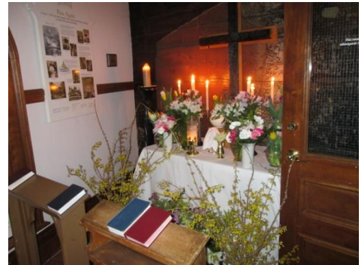
Vigil after the commemoration of the Last Supper on Maundy Thursday.

In the fall of 2018, recognizing the deteriorating state of the 250 year old dry stone walls of the LDC, we commissioned an assessment of these walls. Spring 2019, we applied for and received enough funding from HRM to start the work of restoration. A boundary survey of the church and cemetery, some tree and shrub cutting, and the necessary repairs to the Brunswick Street wall were completed by September. NS Heritage Trust provided funds for the required archeological survey. The boundary survey and archeological survey reports contain fascinating historical material and are available in our Archives. Archival maps and deeds show that the cemetery was established