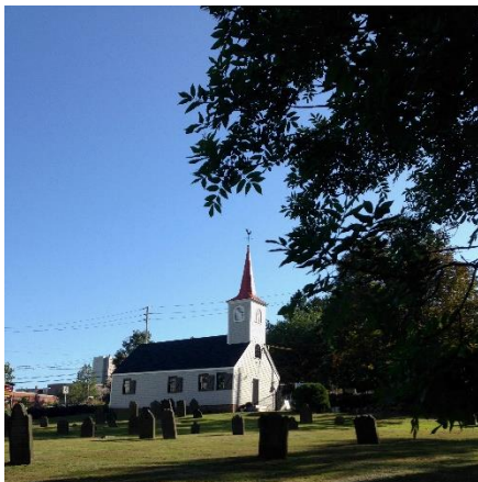
The Little Dutch Church, the original St George's 1756

*Plans for 2020 include painting and plastering in several rooms.