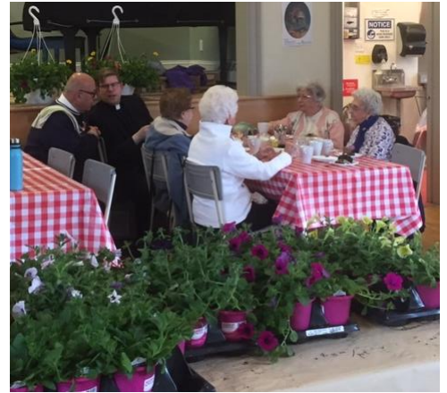
Diners enjoying coffee and turkey burgers at the plant sale.