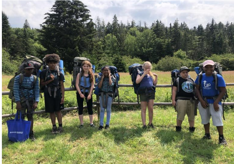
Hike to Cape Chignecto

party, which was well attended by youth, families, the parish, and supporters of YouthNet. Large thanks goes to the Provincial and Federal Summer jobs programs, along with the Segelberg Trust for their financial support of our summer programming.