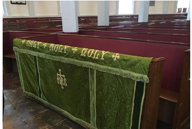
The restored green altar frontal, which hung on the altar during the fire in 1994

In my report for 2018, I explained that we intended to have the green altar-frontal restored in 2019 and would consider purchasing matching vestments. The green frontal was on the altar during the fire that destroyed one-third of the church on June 2nd 1994. Miraculously, it was not badly damaged by fire, smoke, or water, but age had worn holes in the fabric in the past 25 years. The Green Frontal Project became part of our commemoration of the 25th anniversary of the fire.