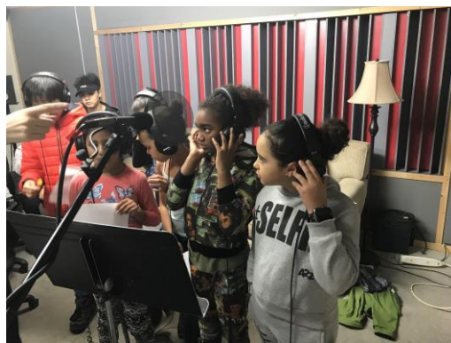
YouthNet visits the Centre for Art Tapes to record our new 'YouthNet song'