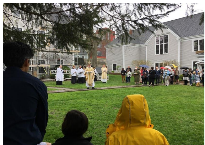
Blessing the Gardens on Rogation Sunday with the Hall and Trinity House (under scaffolding) in the background

Round Church. Extensive painting was undertaken on the main exterior portion of the church in 2019. Many thanks to Edmonds for this work.