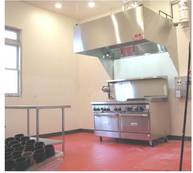
The new stove, installed the final week of February, 2013.

and attractive is a good idea. However, it will also be important for us to be guided by an understanding of how this project expresses the inner and spiritual life of the parish and offers new possibilities for ministry. For example, a group of parents in the parish have been considering for some time how it might be possible to start a parochial school at St George's. Such a school would offer new opportunities for bringing together education and spiritual formation and for furthering the mission of the parish. Such a new beginning would also be an expression of hope and trust in the capacity of the Gospel to prepare young people to live faithfully and wisely amid the challenges of life today. This is just one example of the kind of ministries a refurbished hall could help to make possible.