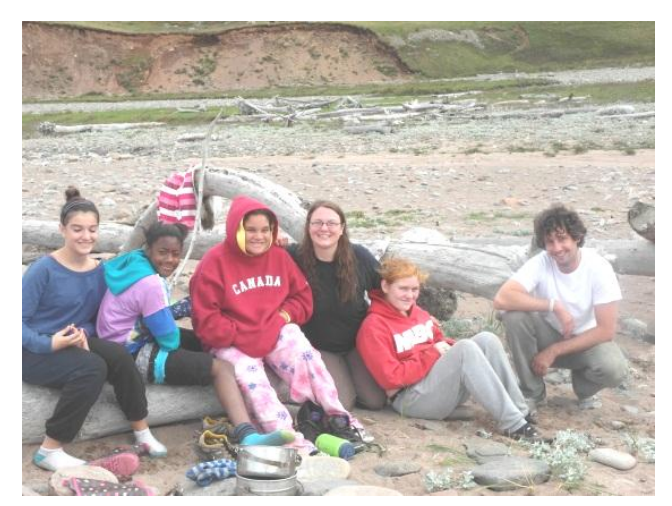
Hanging out at Pollett's Cove, Cape Breton

The highlights of the year came as a result of two one-time grants that allowed YouthNet to expand its wilderness program into the spring and fall and to add a much-needed teen program in September on Tuesdays. This year we did hikes at Cape Split and McNabs Island, two five-night trips at Cape Chignecto, and a trip to Pollet's Cove. These trips allow for the growth of the relationships between youth and staff, which is significant, and contribute to the success of the mentoring relationships staff are able to build with youth, making these trips one of the single most important things YouthNet does. Moreover, the importance of these wilderness trips to the development of the youth themselves cannot be overstated as their impact on participants is long-