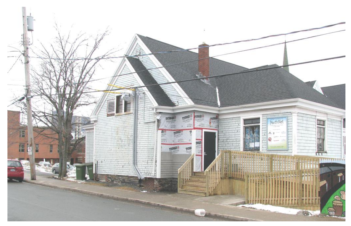
The new doors and the wheelchair ramp were important parts of the renovation work this winter.

The Parish was again the recipient of generous assistance to the YouthNet program, from the United Way Day of Caring program. The project included painting of program rooms. The Parish absorbed the cost of most materials, but all the labour and tools were donated via United Way.