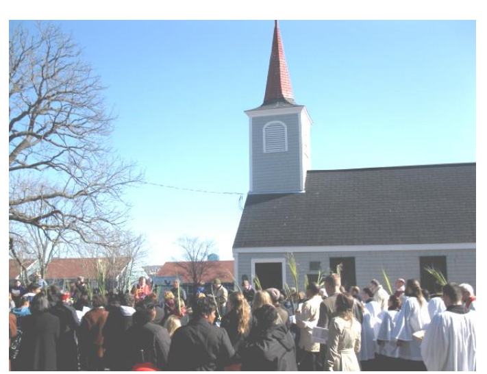
The Little Dutch Church features in our 2012 Palm Sunday procession around the neighbourhood.

This year, I was particularly excited to have been able to re-write the brief Parish History that is now available to visitors and parishioners alike. This is the first time that the History has been rewritten and updated in booklet form for over 50 years, and I hope that many will discover and enjoy the church's rich history through this medium. In addition to this project, I led tours of the Round Church and Little Dutch Church and we had over 100 visitors – some from as far away as Australia! St Patrick's Roman Catholic Church (across the street) also began offering historic tours last summer. Their organizers were quite impressed with St George's rich history as well as our number of visitors. Hopefully, we can use these ties