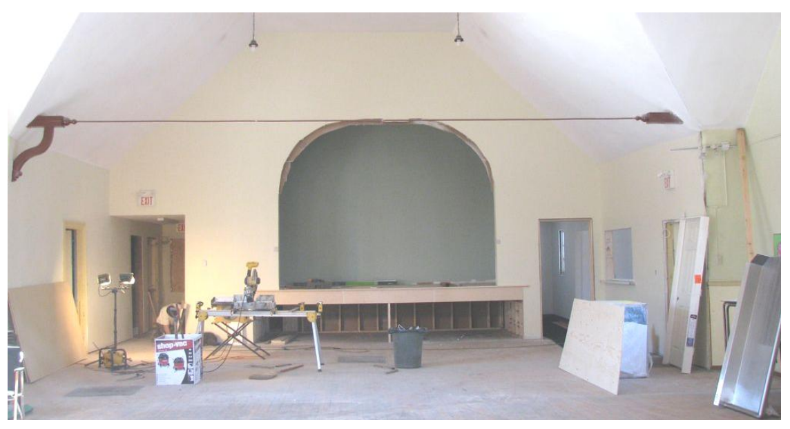
The hall transformed into a construction zone as work was done on the storage area, stage, and kitchen.