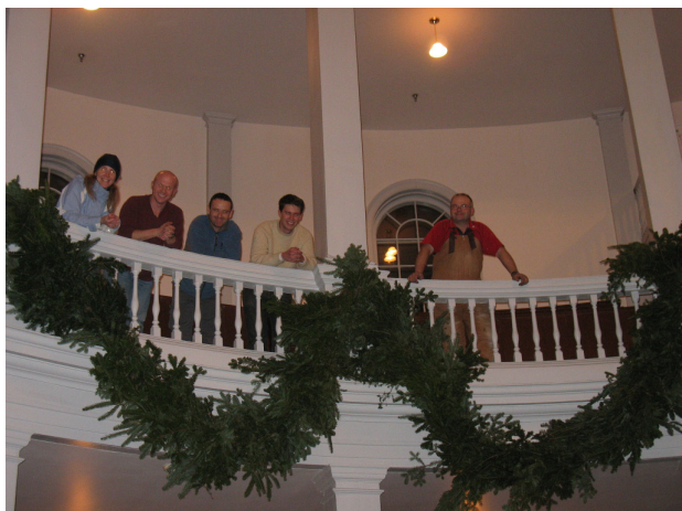
Part of the garland-making-team putting up the Christmas garland.