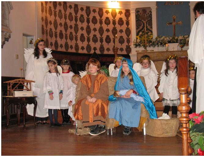
The Christmas Eve service for Children and Families