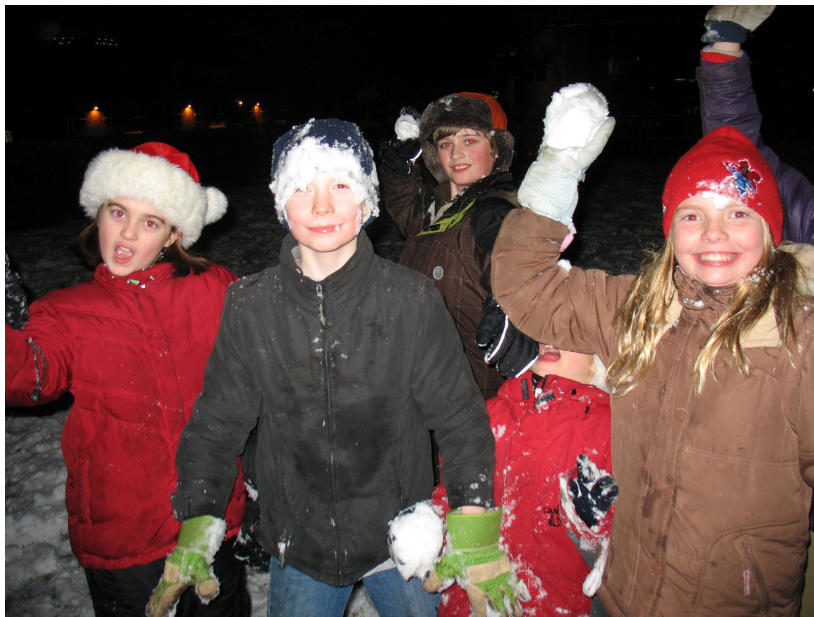
Sunday School children take a break from helping make the Christmas Garland to play in the snow!