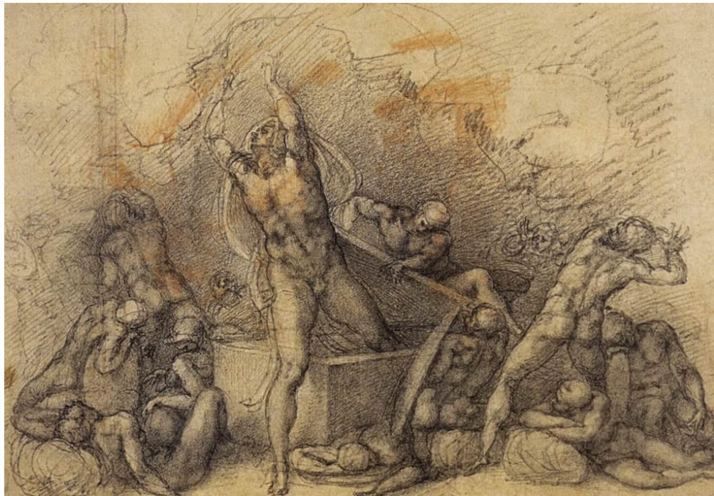
The Resurrection. (1520 - 1525). Michaelangelo (1475 - 1564). Black chalk.