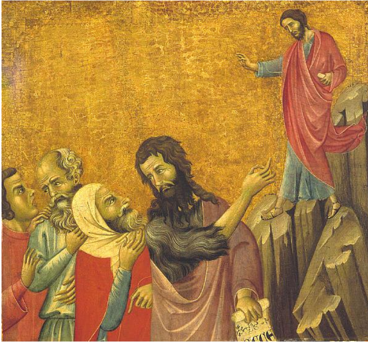
The Witness of John the Baptist, by the Master of San Torpè, 1310-20