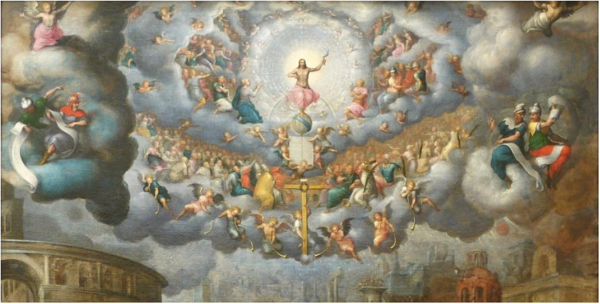
Detail from Le Jugement Dernier [The Last Judgement]. (1585). Jean Cousin le Jeune (1536-1595)